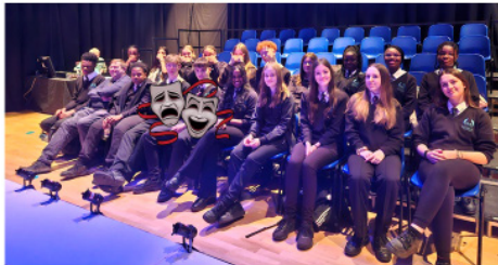
Year 10 GCSE Drama Students excited for the show to start.

Students are excited at the prospect of the two week break from school but equally excited at the live prize draw that will be taking place Thursday morning during tutor time for the Golden Ticket Winners. Fingers crossed for all our students. I hope you, and your families, enjoy the two week break and that the intermittent sunshine continues.