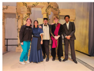
Ex Stopsley Students take on key roles in the performance.